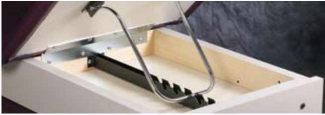
Pre-mounted heavy-duty, all steel adjustable backrest support system

Style Line Cabinet Models feature contemporary design, convenient ample storage and easy clean laminate surfaces. These great looking cabinet style tables are available in 9 coordinated laminate and vinyl colors to enhance and complement any decor.