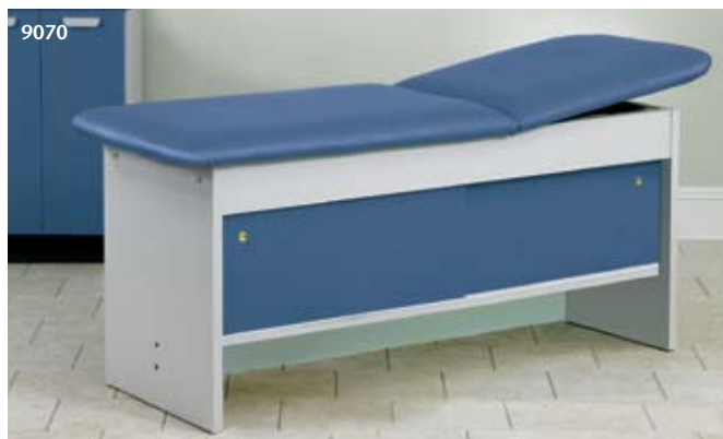
Cabinet Style Laminate Treatment Table Quick Ship *