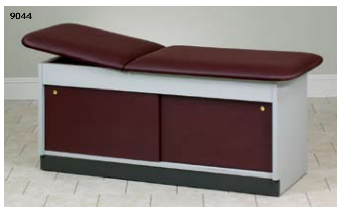
Cabinet Style Laminate Treatment Table Quick Ship *