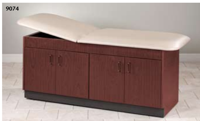
Cabinet Style Laminate Treatment Table