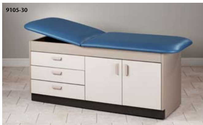
Cabinet Style Laminate Treatment Table